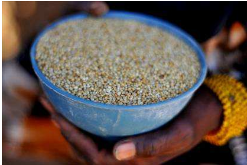
Sana community member holds bowl of millet to donate to the school canteen.